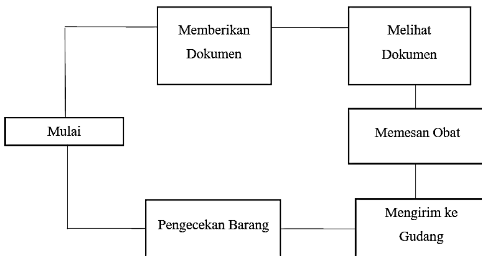
Figure 2. The Flow of the Drug Supply Distribution Procedure

The department directly responsible for distributing and administering these drugs is the pharmaceutical installation section of the Dumai City Hospital. Pharmacy installation is a means of supporting health services in the management of health drugs, medical devices, and chemicals. The distribution of drugs at the Dumai City Hospital first starts from: