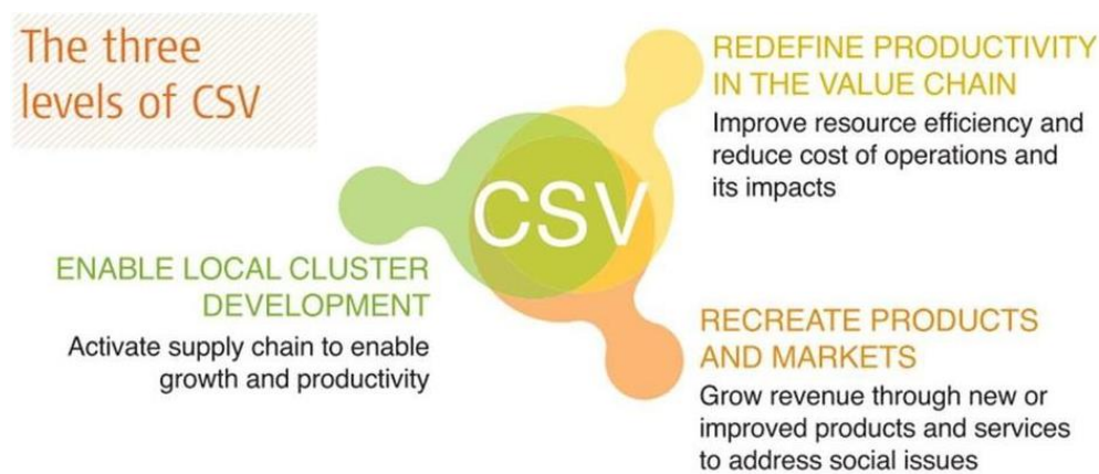
Figure 2. Creating Shared Value