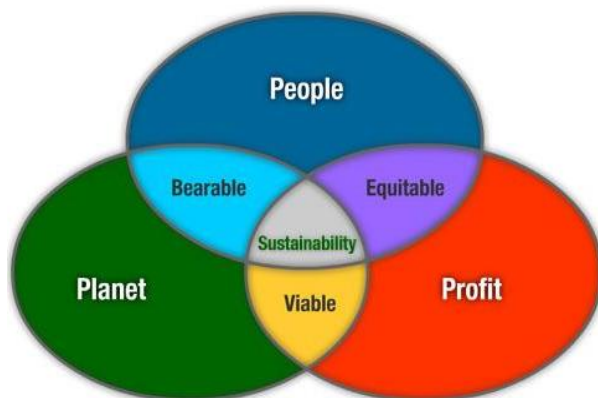
Figure 1. Triple Bottom Line

Source: google.com secondary data. triple bottom line